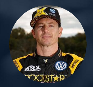
TANNER FOUST 1.5M SOCIAL FOLLOWERS *** *** *** *** *** ***