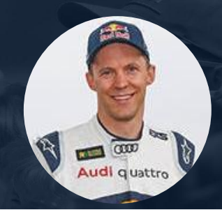
MATTIAS EKSTROM 175K SOCIAL FOLLOWERS *** *** *** *** *** ***