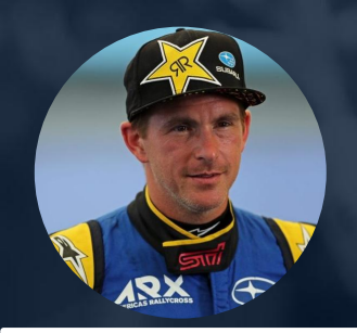
SCOTT SPEED 180K SOCIAL FOLLOWERS *** *** *** *** *** ***