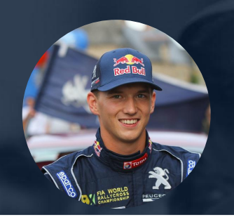
TIMMY HANSEN 118K SOCIAL FOLLOWERS ** ** ** ** ** **